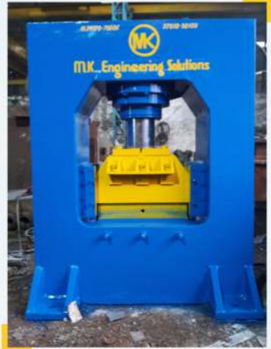
Hydraulic Cold Shear Machine