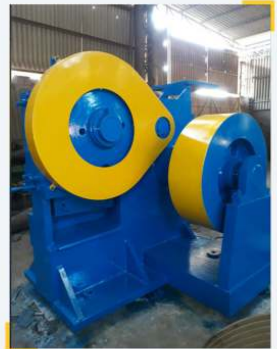
Billet Shearing Machine