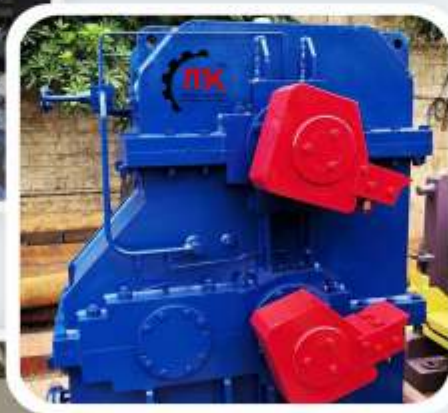
Crop & Cobble Shear